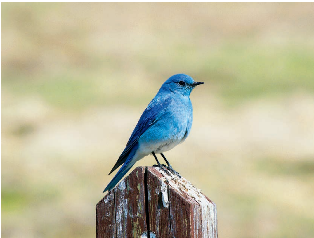
Mountain Bluebird, Colorado

Copyright © 2015 Massachusetts Medical Society.